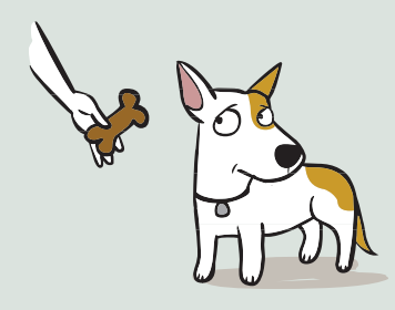
Suddenly Won't Eat but was hungry earlier